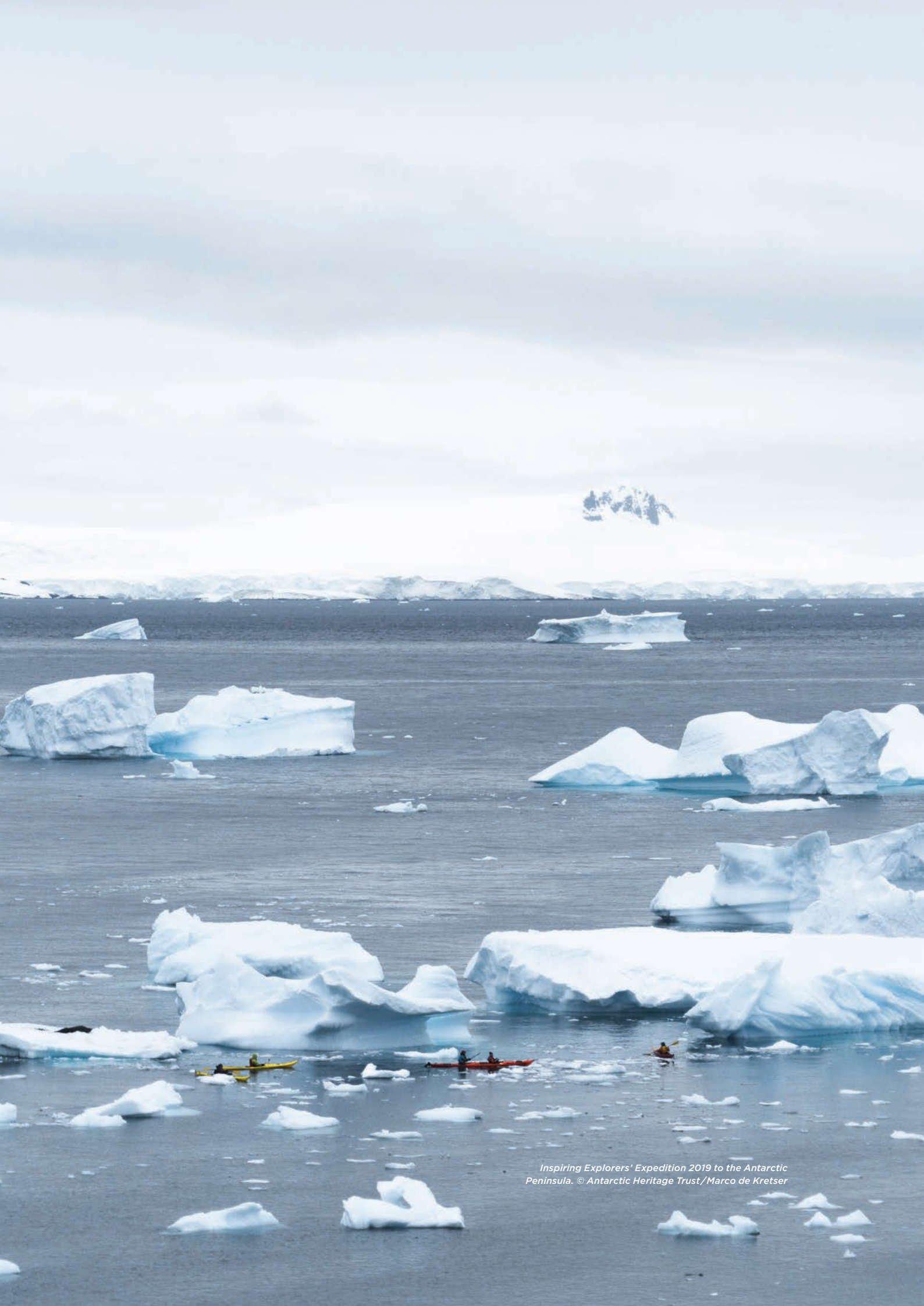
Inspiring Explorers' Expedition 2019 to the Antarctic Peninsula.