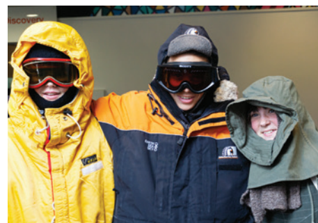
Young explorers trying on Antarctic clothing from different eras at Canterbury Museum, Christchurch, New Zealand.