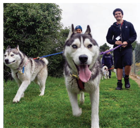
Young explorers working with huskies at Husky Rescue NZ.

"To be prepared for what life throws at us, we need a bank of experiences under