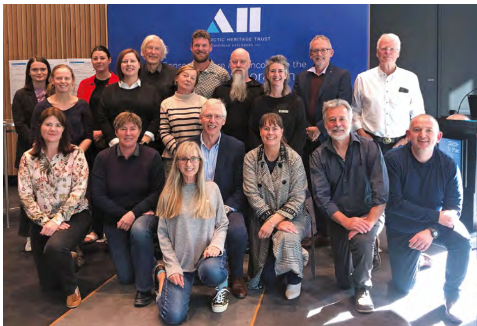
2023 Conservation Management Plans workshop participants.