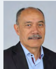
The Rt Hon Sir Jerry Mateparae.

We are delighted to announce that Rt Hon Sir Jerry Mateparae GNZM QSO KStJ has joined the Trust's Board as an Independent Trustee. Sir Jerry served as the 20 th Governor-General of New Zealand from 2011-2016 and subsequently as the 27 th New Zealand High Commissioner to the United Kingdom from 2017-2020.