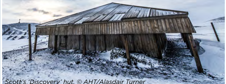
Scott's 'Discovery' hut.

We are grateful to have received some funding from Manatū Taonga Ministry for Culture and Heritage Cultural Sector Regeneration Fund. The Trust is working with StaplesVR to develop the experience, which will open up virtual access to this historically significant site.